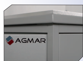
High execution quality