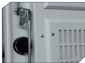
Doors opening mechanism