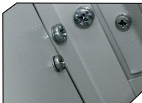
Aluminium, screwed construction