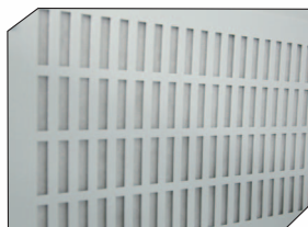
Ventilation panel with filter mat