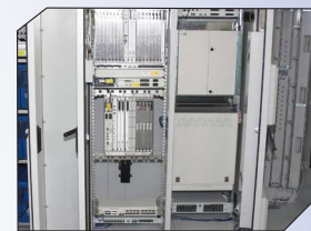
Protective cloth filter