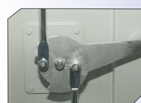
Doors lock mechanism