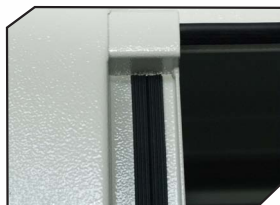
Vertically divided doors sealing